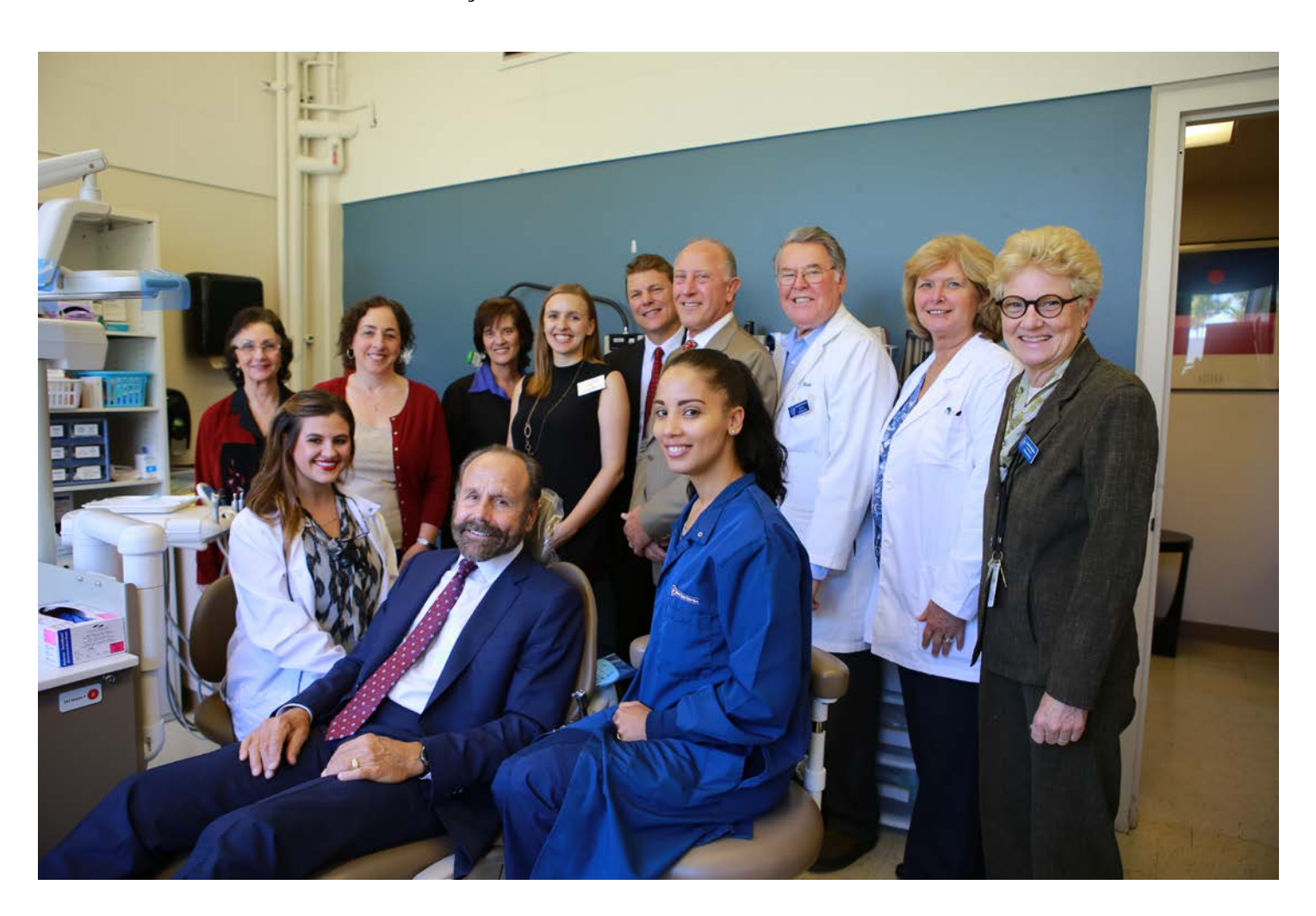
Photo of the Month: State Senator Jerry Hill in the "hot seat" at CSM's mobile dental clinic

The College is celebrating Latinx Heritage Month by holding a number of cultural events including film screenings, brown bag discussions, and lectures. For more information and a detailed list of events and locations please visit: <a href="https://www.facebook.com/events/1766831133567414/">https://www.facebook.com/events/1766831133567414/</a>